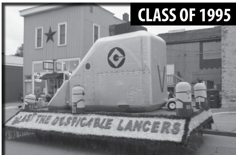
CLASS OF 1995