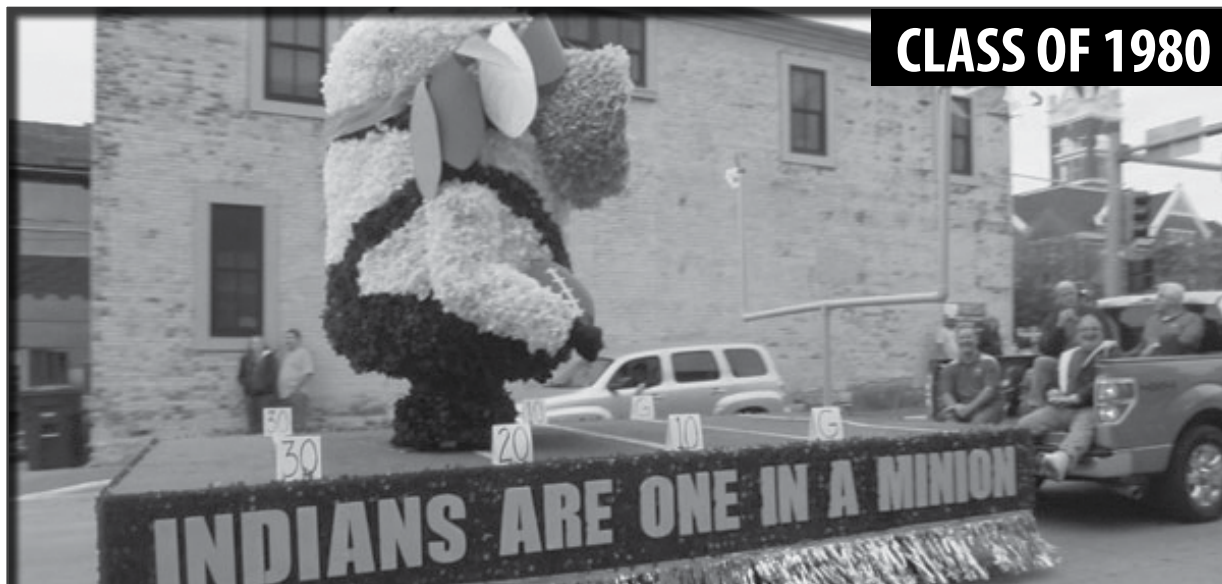
CLASS OF 1980